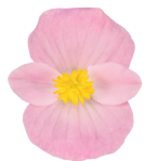
Brandy ® BS0802P