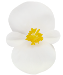
Whisky ® BS0806P