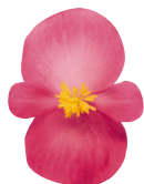
Deep Rose BS0904P