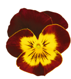
Red Yellow Face VC0121R/E