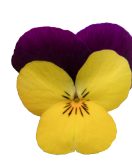
Limoncello Purple Wing VC0131R/E