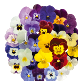
Maxi Mix VC0199R/E