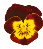
Red Yellow Face VC0121R/E