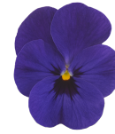
Deep Blue VC0104R/E