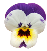
Jolly® Face VC0103R/E