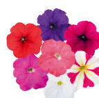
Maxi Mix PH0299P