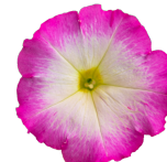
Rose Morn PH0211P